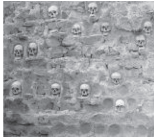
Fig 2 a: The Skull Tower

projectile generates high pressure wave that displaced tissue away from the missile trajectory. That pressure wave described often results in the instantaneous death at the scene due to the brain stem incarceration.