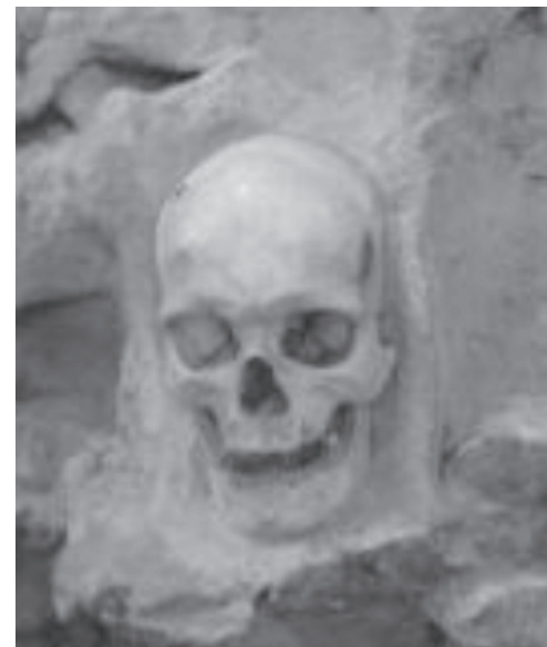
Fig 2 b: The skull of the injured who sustained cross and cross gunshot wound from the close distance. Note the black colored ring of gunpowder in the bone at the bullet entry.

It was shown that more kinetic energy is transferred to surrounding brain where missile undergoes greatest slowing. The bullets with greater specific kinetic energy i.e. with small mass and surface space display the greatest slowing on the target because the amount of specific kinetic energy is oppositely proportional to the projectile surface space (specific kinetic energy = kinetic energy/surface space of the bullet).