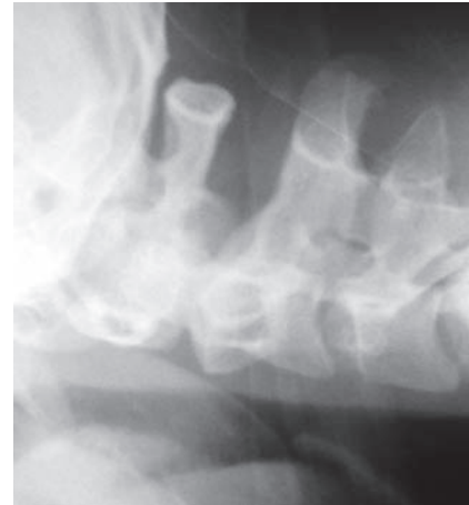
Fig 1: Plain x-ray lateral view of cervical spine showing normal vertebral bodies and soft tissue shadow

spine immobilization using a Philadelphia collar.