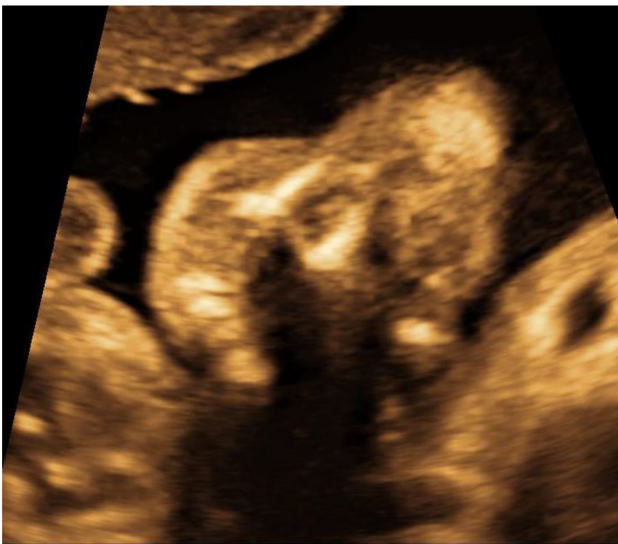
Fig. 5 Visualization of nasal bone in two dimensional coronal view, the absence of the echogenic dots at the apex of retro nasal triangle suggests the absence of nasal bones