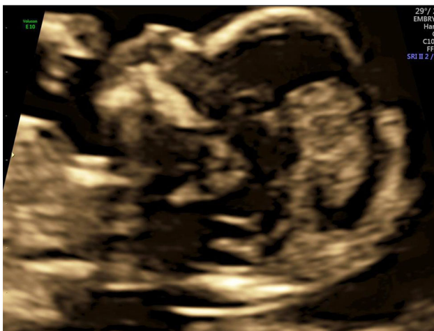
Fig. 1 Mid sagittal view of face with three distinct lines confirming presence of nasal bone

All the scans were done/supervised by qualified fetal medicine specialist. Absent nasal bone (unossified NB) was suspected when in the mid-sagittal view of face, three distinct lines, first nasal bone, second skin and third tip of the nose were not seen. The confirmation was done by visualizing two echogenic dots at the apex of the retranasal