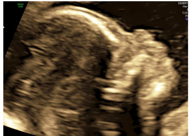
Fig. 2 Magnified Mid sagittal view of fetal head with absent nasal bone. Visualization of nasal bone in two-dimensional images of the fetal head in the sagittal plane, enlarged to include nose, lips, maxilla and mandible

triangle in coronal view in 2D and reconstructed 3D view (Figs. 3, 4, 5, 6).