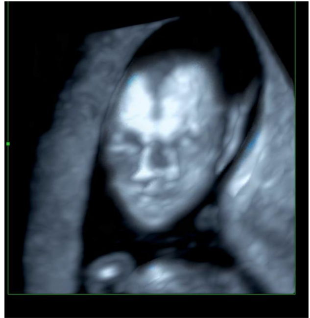
Fig. 6 Three dimensional view of the face in coronal plane, the absence of the echogenic dots at the apex of retro nasal triangle suggests the absence of nasal bones

Out of 2339 cases scanned between 1st Jan 2017 to 30th June 2018, 380 (16.2%) were abnormal, 4 cases were diagnosed with Down's syndrome, 31 cases had facial anomalies (1.3% of total scans and 8.1% of abnormal scans), 12 cases showed isolated absent (hypoplasia) nasal bones (3.1% of total scans and 38.7% of abnormal scans), unilateral cleft lip and cleft palate was found in 6 cases, bilateral cleft lip and palate was found in 3 cases, ear abnormalities were found in 4 cases, micrognathia in 3 cases and 1 case each with dysmorphic facies, Binder's facies, and microphthalmia (Fig. 7).