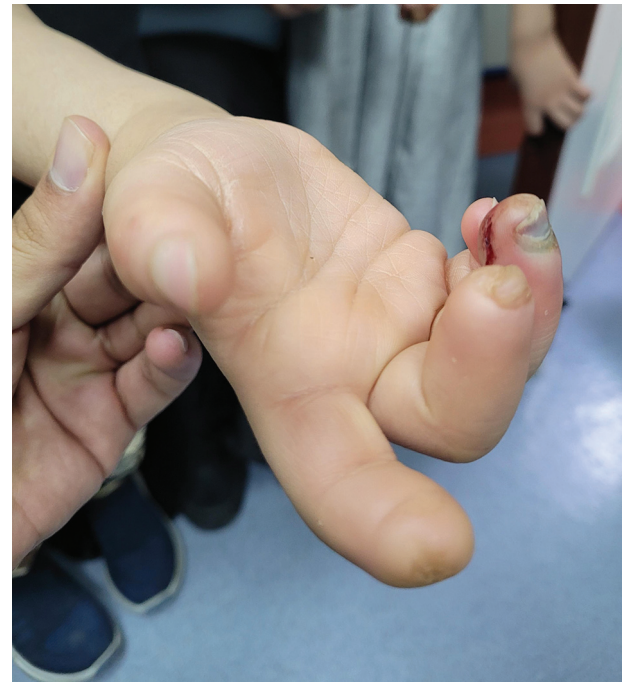
Fig. 2 Auto amputated fingers.

He had multiple scratch marks on his body, a large bleeding mouth ulcer, and several small ulcers on his fingers.