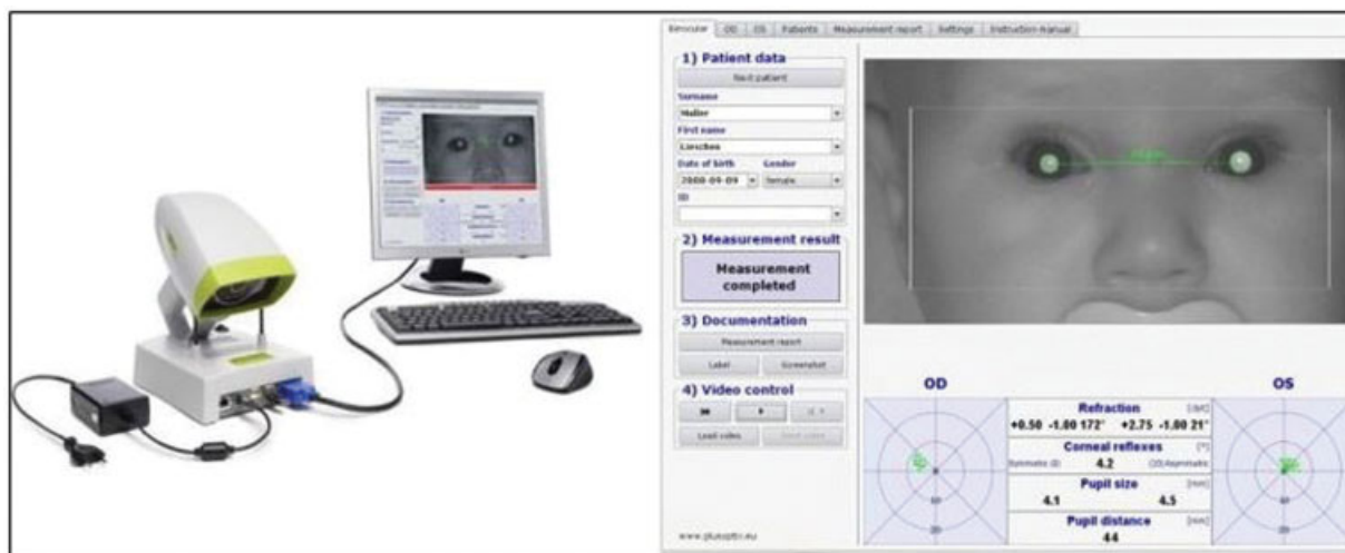
Fig. 1 The handheld photo-refractometer device used in the study and the image of working principles.

Of the 7,000 students who were screened, 3,481 (49.7%) were female, while 3,519 (50.3%) were male. The mean age of the