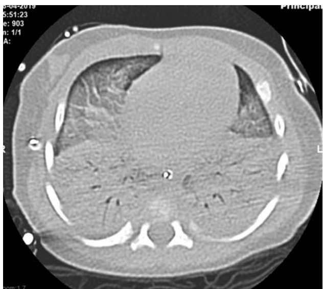
Fig. 2 Computed tomography of chest with signs of diffuse alveolar hemorrhage.

The following etiological studies were performed: blood cultures, tracheal aspirate culture, cerebrospinal fluid culture, test for respiratory viruses, polymerase chain reaction for Pneumocystis jiroveci , serology for cytomegalovirus, enzyme-linked immunosorbent assay test for human immunodeficiency virus, immunological tests, and study for inborn