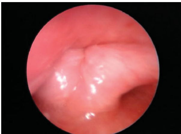
Fig. 2 The mucopolysaccharidosis II glottis on inspiration showing indrawing of the redundant arytenoid tissue.

These changes will result in obstructive sleep apnea (OSA) to a varying degree with resultant effects on the well-being of the patient such as daytime somnolence or in the severe case pulmonary hypertension. Treatment is, therefore, essential to both improve quality of life and avoid serious complications. Treatment usually starts with adenotonsillectomy, but this may only be partially effective due to the other airway