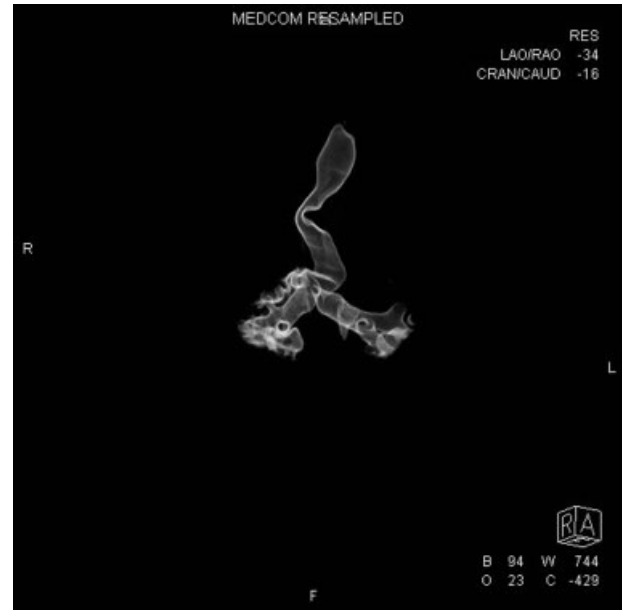
Fig. 3 Reconstructed computed tomography of the trachea in a mucopolysaccharidosis IV patient showing tortuosity of the trachea.

issues or in the longer term with regrowth of the tissues. Treatment in more severe cases can be tried with noninvasive ventilation via either a facemask or nasal mask. Compliance in MPS patients is often poor with these techniques and in some cases a tracheostomy may be necessary. 19,20 Tracheostomy is notoriously difficult in these patients due to anatomical problems such as the short stiff neck and immobile cervical spine and a trachea buried deep in the neck often almost in the superior mediastinum. Tracheostomy is never an easy option but may improve quality of life dramatically in