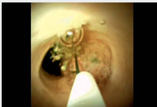
► Video 1 Use of a cholangioscopy-guided retrieval snare for the macrobiopsy of a choledochal polyp.