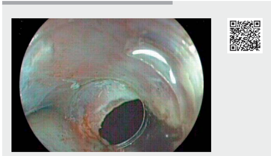
► Video 1 Clip-with-line traction suture method with adaptation of the mucosal flap in a large transmural defect after submucosal tunneling endoscopic resection.

Broad-spectrum antibiotic therapy was given. The following day, an esophagram confirmed no leakage and a liquid