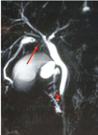
► Fig. 1 Magnetic resonance cholangiopancreatography revealed one calculus in the right anterior sectoral duct (arrow) and another small calculus in the distal bile duct (arrow head).

Hepatoolithiasis or intrahepatic duct calculi is one of the most complex stone diseases as it poses a great challenge in treatment and also has strong propensity for recurrence. It may be complicated by bile duct strictures, cholangiolytic abscesses, and cholangiocarcinoma [1]. The main endpoint of the treatment for hepatoolithiasis would be stone clearance, stricture correction, and restoration of biliary drainage [2].