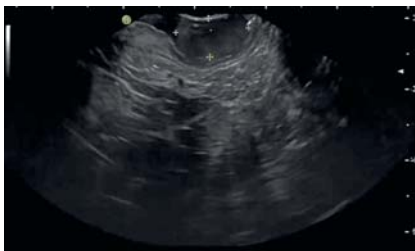
► Fig. 2 Endoscopic ultrasonography evidence of a hypoechoic lesion arising from the second wall layer with preserved wall layers and no deep infiltration.