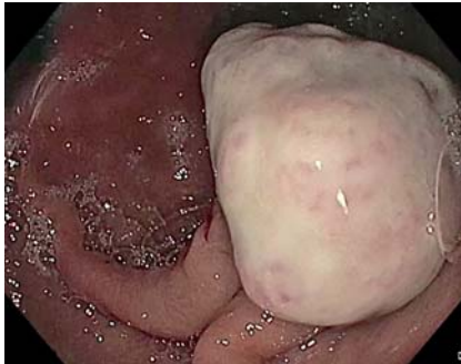
► Fig. 1 20-mm polypoid lesion with a superficial white film covering the head.