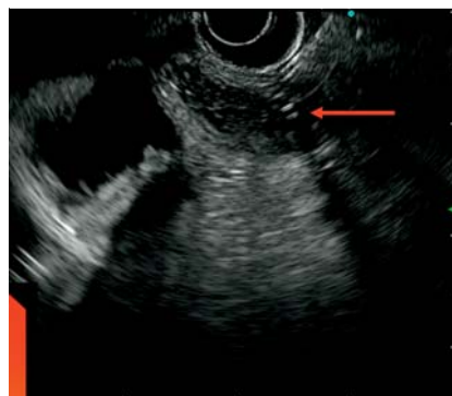
► Fig. 1 Endoscopic ultrasound visualization of the alimentary limb with a 7-French cannula in place (red arrow).