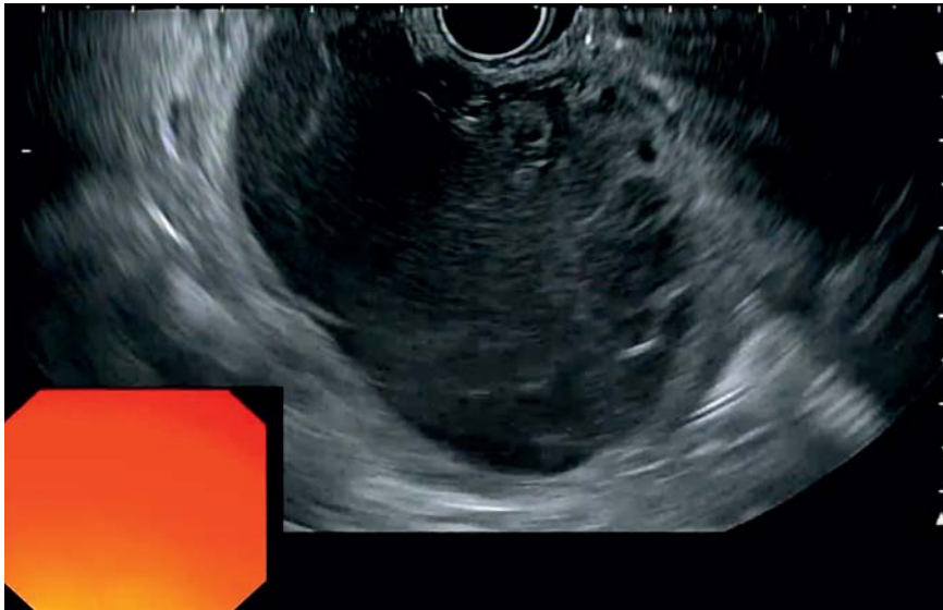
► Fig. 2 Endoscopic ultrasound image of the duodenal duplication cyst.